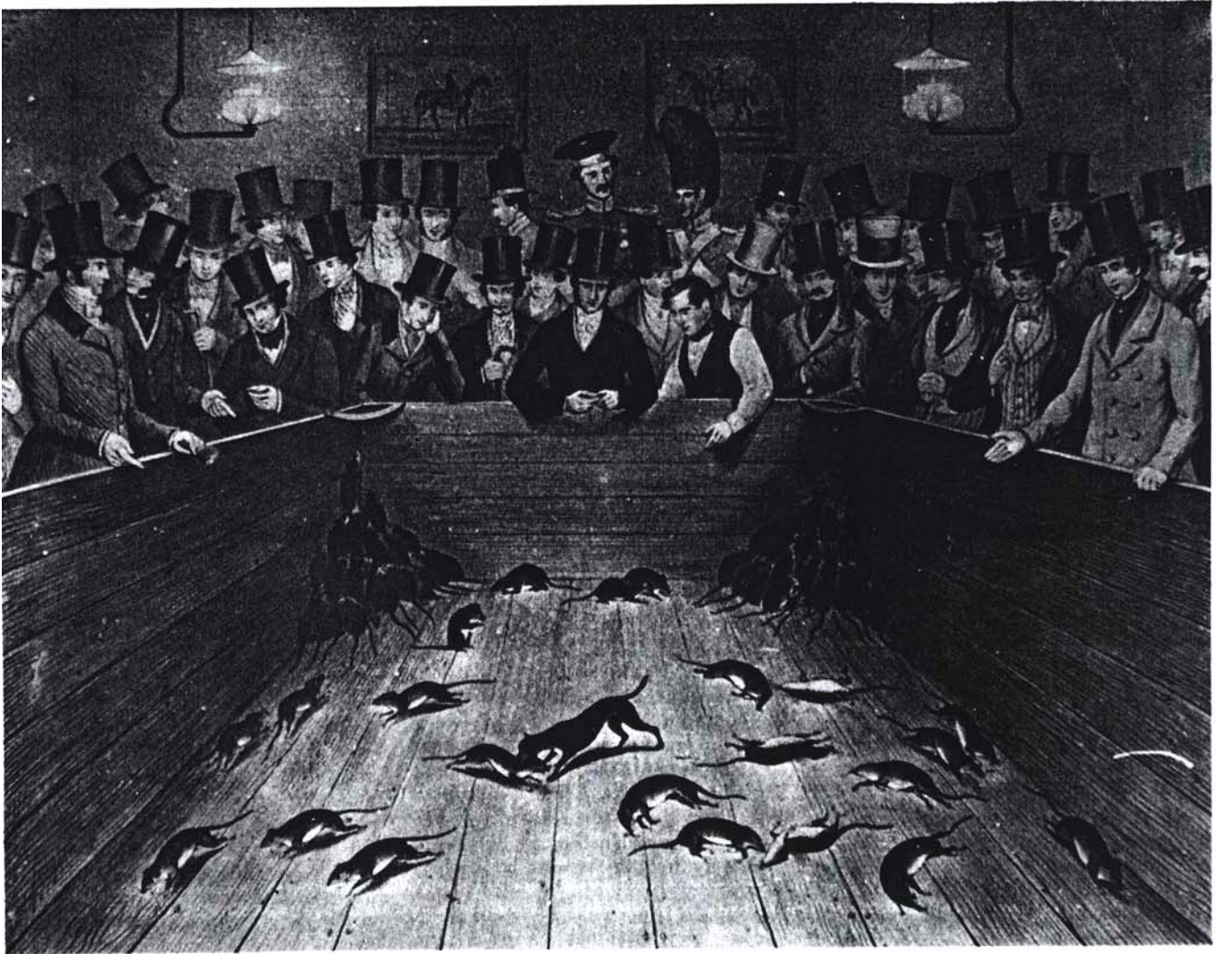
A typical Victorian engraving of an English dog pit in London showing: "Tiny the Wonder, the property of James Shaw, the Blue Anchor, Bunhill Road, St Lukes, London, 1847, killing 100 rats."

a-half minutes. The black and tan was later crossed with the whippet to produce the modern Manchester terrier and with the bulldog to produce the bull terrier.