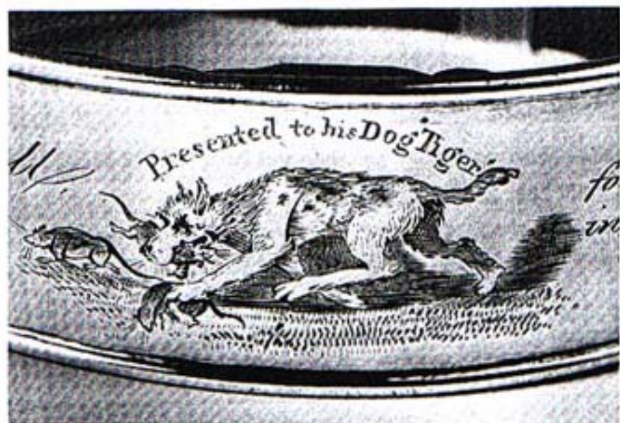
The engraving of Tiger on the collar . . .