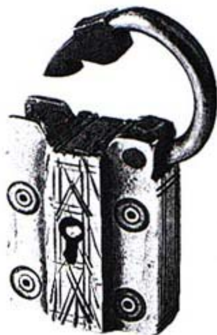
The padlock: its keyhole is a dining and it has a secret system of opening by catches.

in George Street. He did not, however, become the licensee of the Welsh Harp until July 21, 1835.